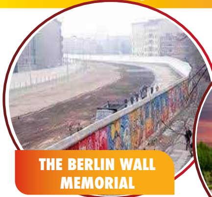
THE BERLIN WALL MEMORIAL