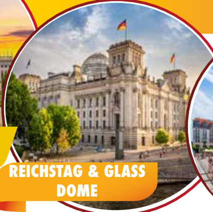
REICHSTAG & GLASS DOME