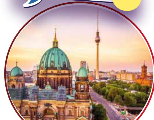
The Berlin Cathedral and Television Tower